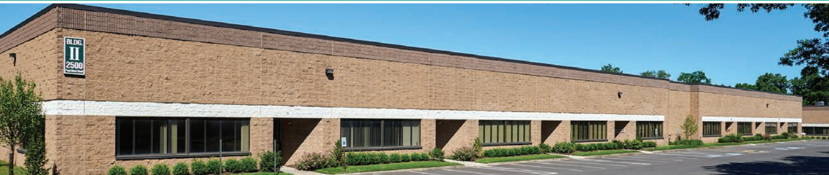
KBC II, 2500 PEARL BUCK ROAD, BRISTOL TOWNSHIP, BUCKS COUNTY, PA