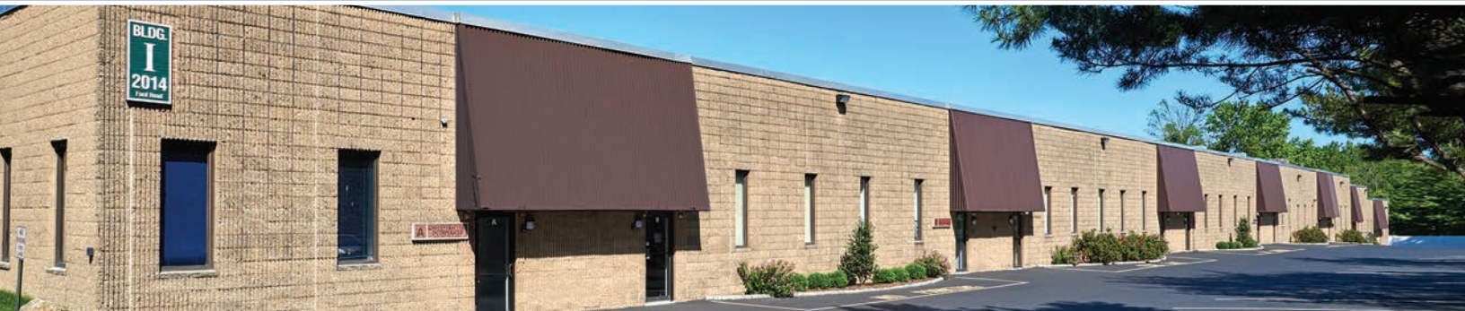
KBC I, 2014 FORD ROAD, BRISTOL TOWNSHIP, BUCKS COUNTY, PA