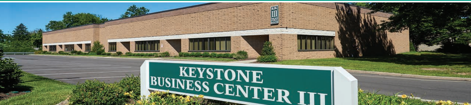
KBC III, 2522 PEARL BUCK ROAD, BRISTOL TOWNSHIP, BUCKS COUNTY, PA

CEILING HEIGHT: KBC I: 16'0" clear under bar joist. KBC II: 19'5" sloping to 18'3" clear under bar joist. KBC III: 19'1" sloping to 17'10" clear under bar joist.